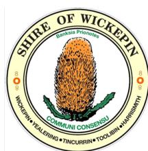
SHIRE OF WICKEPIN

The following advert was placed in the in the Narrogin Observer and the Watershed.