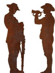
Silhouette statues 1.7m high Steel cut-out: Corten (rust) finish