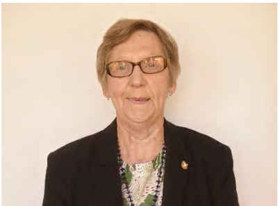
Cr F Allan Councillor Retiring 2027