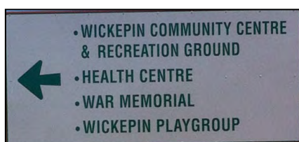
Shire of Wickepin Directional