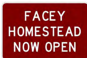
Heritage Sign - White Lettering on a brown