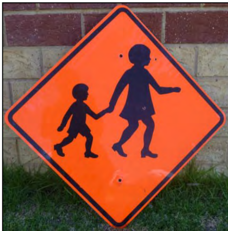
School Bus Sign

The location of the sign on the road reserve is to be determined by the MWS.