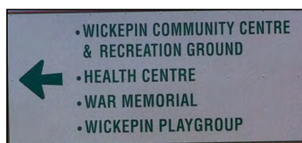
Shire of Wickepin Directional