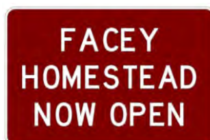
Heritage Sign - White Lettering on a brown